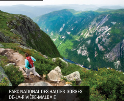
PARC NATIONAL DES HAUTES-GORGES-DE-LA-RIVIÈRE-MALBAIE