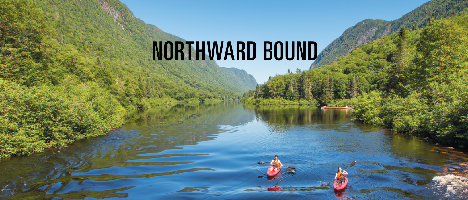
PARC NATIONAL DE LA JACQUES-CARTIER